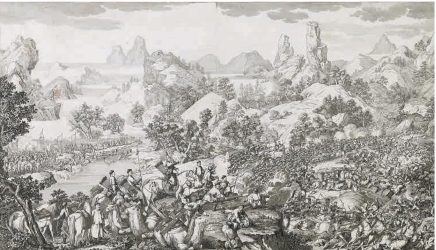
Figur The Victory of the Ping of The Blackwater Circuit 61.8 long, 93.2 cm Pinto 021264 National Palace