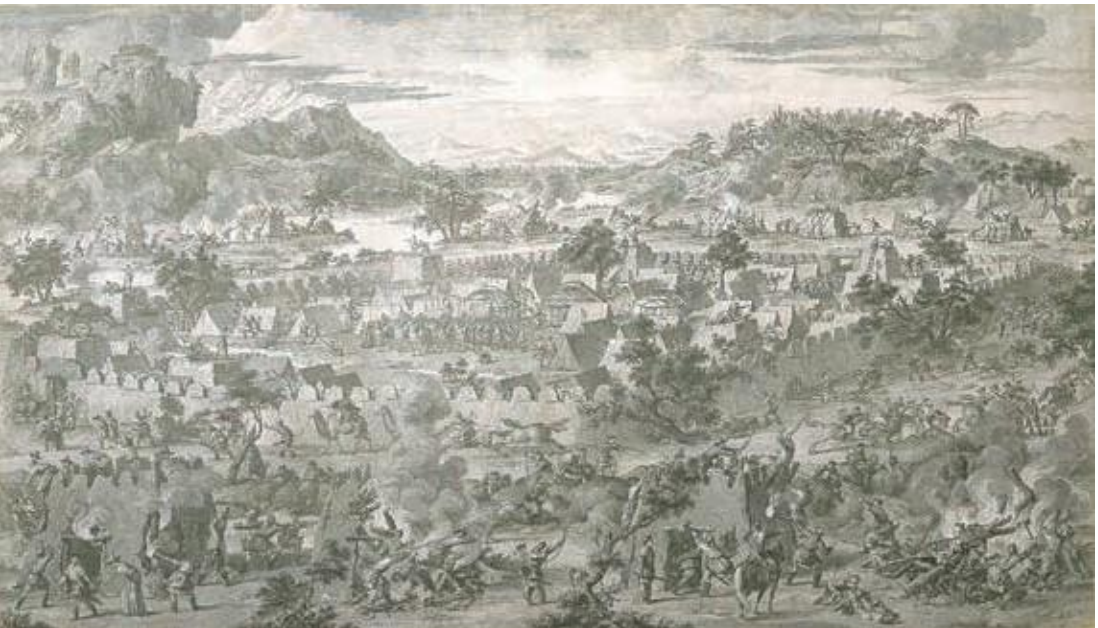
Figure 1. The Battle of Tungusluk, vertical 58, horizontal 95 centimetres, plain drawing 021242, depicts the attack by Zhaowei on the enemy platform outside Heshui National Palace

The Tang called it the "Sandwich City", meaning that our troops would die when they were fed. Note 5