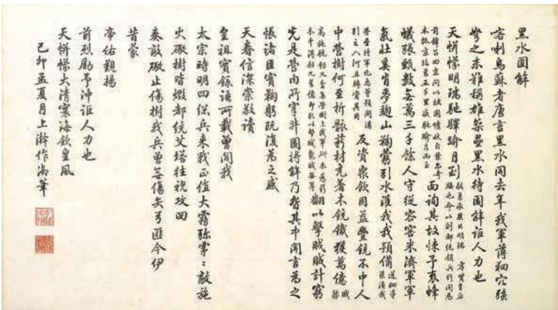
Figure The Victory of the Ping of Poem on the 58 vertical by 95 horizontal National Palace

The Qianlong emperor used French copper-engraving techniques to produce a copper-engraving of the victorious picture, and a poem printed in engraved form, with an imperial preface and postscript, to create an exquisite set of thirty-four pictures of the victorious picture of the pacification of the Jingaer Hui. This is a combination of the world's