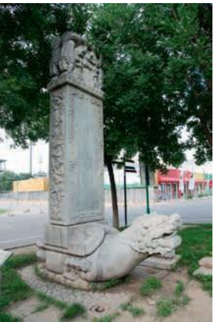
Figure: Zhaowei's tomb carved. Located in Beijing

Kuche opens the city and surrenders to Zhaowei's army