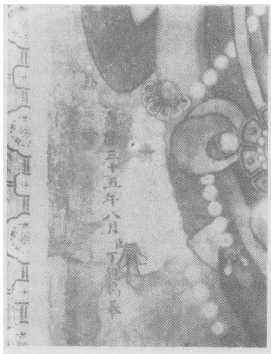
图三 《说法图》横轴上丁观鹏之署款 (现藏西柏林国立民俗博物馆)

徐扬画《乾隆南巡图》第三卷，绢本设色画，纵70.4厘米、横1,607厘米，现藏法国尼斯市魁黑博物馆。徐扬曾经画过两套《乾隆南巡图》，各十二卷，内容相同，一套为纸本设色画，作于乾隆三十六至四十年（177 1 —1775年）间，保存完整，现藏于北京中国历史博物馆；另一套为绢本设色画，作于乾隆二十九至三十四年（1764—1769年）间，现已散佚不全，除故宫博物院藏有第九、十二卷外，美国纽约大都会艺术博物馆藏有第四卷，法国巴黎吉美博物馆藏有第十卷，还有一卷