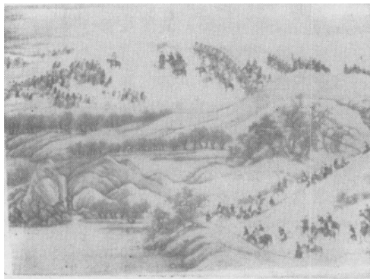
图一 Detail from Volume Four of the Kangxi Southern Inspection Tour (presently housed in the Guimet Museum, Paris)

gathered by the roadside to watch. The cavalry crosses a three-arched stone bridge,