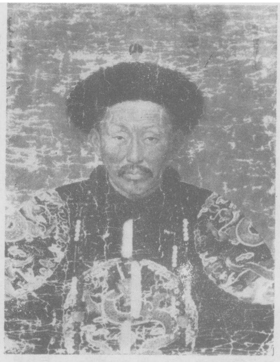
图四 “都尔伯特汗策凌”油画肖像 清·王致诚 (现藏西柏林国立民俗博物馆)