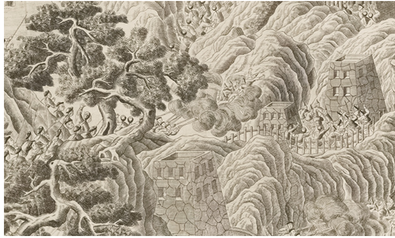
Detail of soldiers fighting amidst a lush landscape from the print above