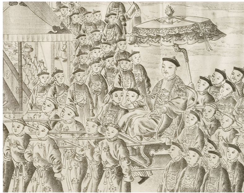
Detail of Chinese emperor Qianlong being carried in triumph from the plate above

The Chinese prints were inspired by European battle prints, which had been brought to China by the Jesuits or sent as imperial gifts from European courts. In 1765 the Qianlong Emperor ordered prints commemorating his recent victories against the Zhungar troops. Drawings made