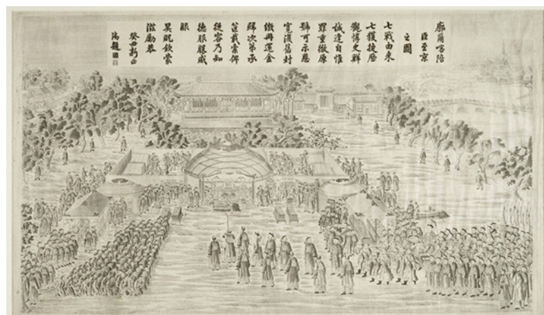
Ping ding Kuoerke zhan tu , or Pictures of the Campaigns against the Gurkhas (i.e., Nepalese) , China, ca. 1793. The Getty Research Institute, 2012.PR.33