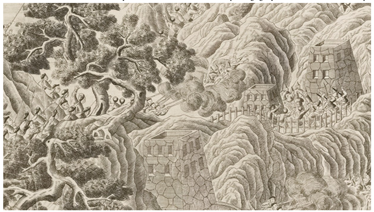
Detail of soldiers fighting amidst a lush landscape from the print above