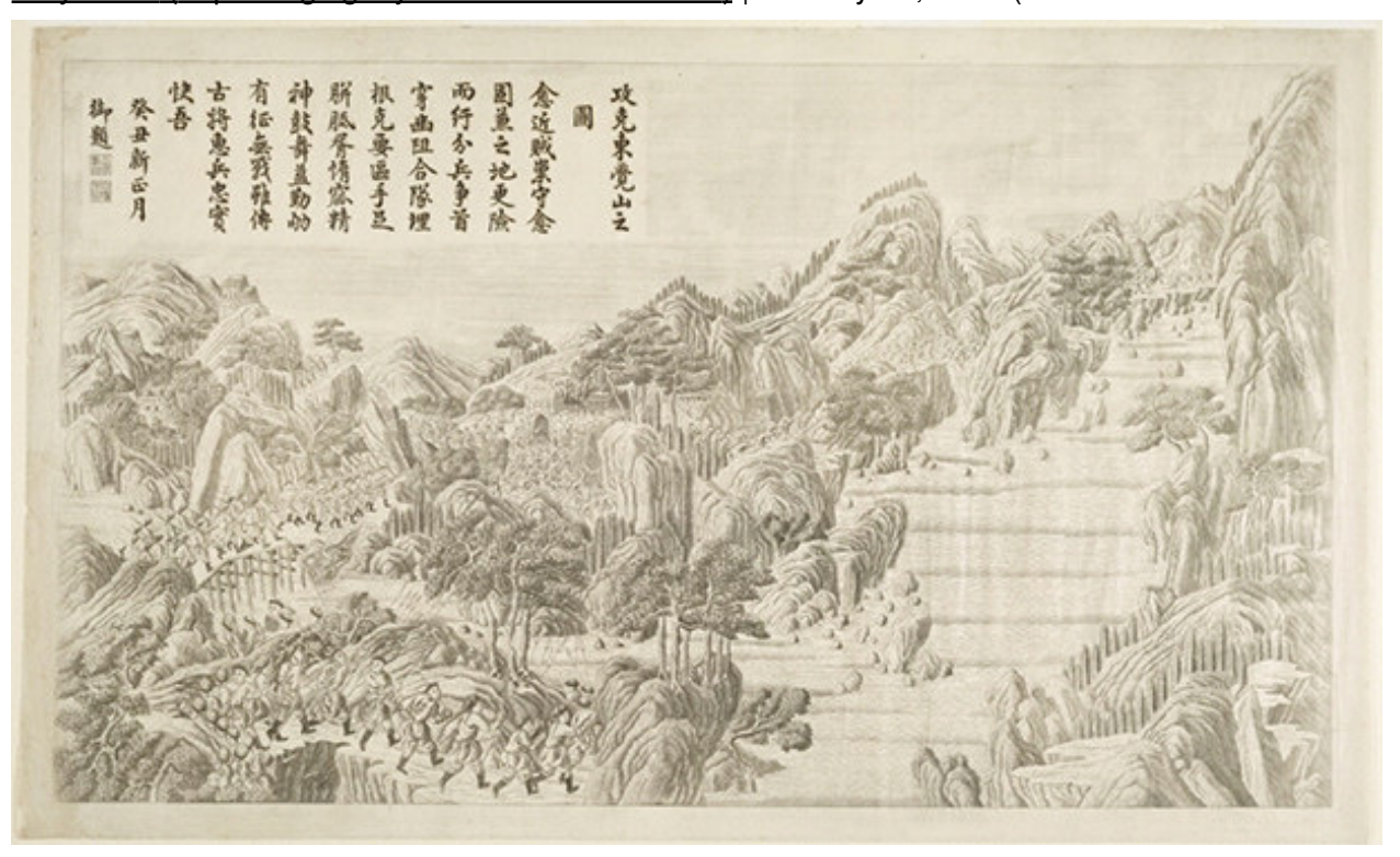
Ping ding Kuoerke zhan tu, or Pictures of the Campaigns against the Gurkhas (i.e., Nepalese), China, ca. 1793. The Getty Research Institute, 2012.PR.33

Amy Hood (http://blogs.getty.edu/iris/author/ahood/) | January 17, 2013 (2013-01-17T13:05:08-0800)