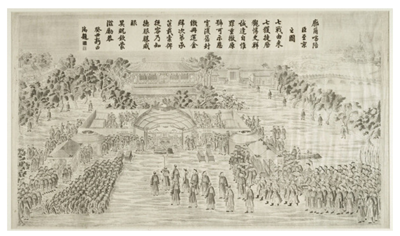
Ping ding Kuoerke zhan tu, or Pictures of the Campaigns against the Gurkhas (i.e., Nepalese), China, ca. 1793. The Getty Research Institute, 2012.PR.33

(http://hdl.handle.net/10020/cat983849), they depict the successful military campaign of the Qianlong Emperor (reigned 1736–1795) against Nepalese warriors. These large-format copper engravings represent the complete set of prints commissioned by the Qianlong Emperor to commemorate the victory in 1792. Printed in China, this series is one of seven so-called "Conquest" suites.