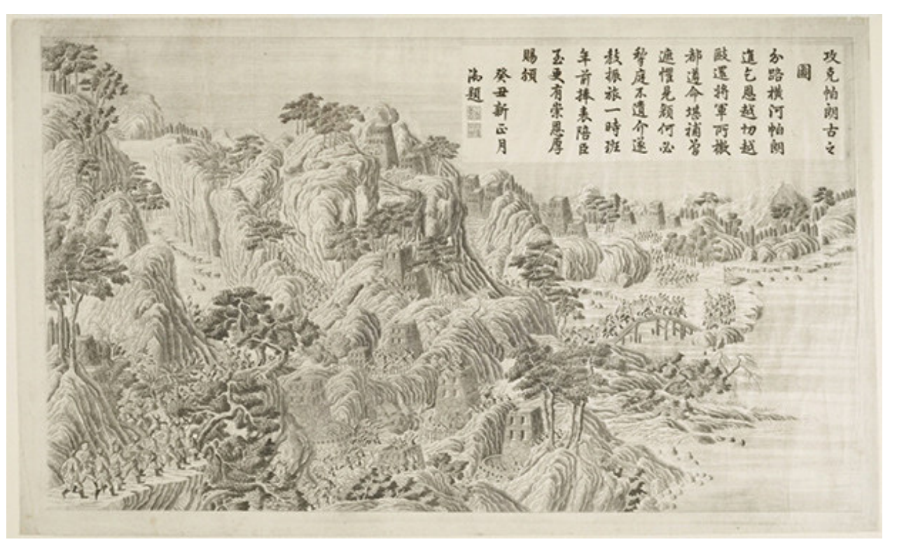
Ping ding Kuoerke zhan tu, or Pictures of the Campaigns against the Gurkhas (i.e., Nepalese), China, ca. 1793. The Getty Research Institute, 2012.PR.33

These intricate and stunning prints are in near-perfect original condition, and stand out as highly unusual examples of Chinese images executed with European graphic techniques. The Getty's suite is the only complete set in American public collections. At the Research Institute, these understudied prints join a stellar collection of works on paper about China that highlight cross-cultural connections between Europe and China in the early modern era.