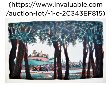
Maurice Utrillo Winter In Mon...