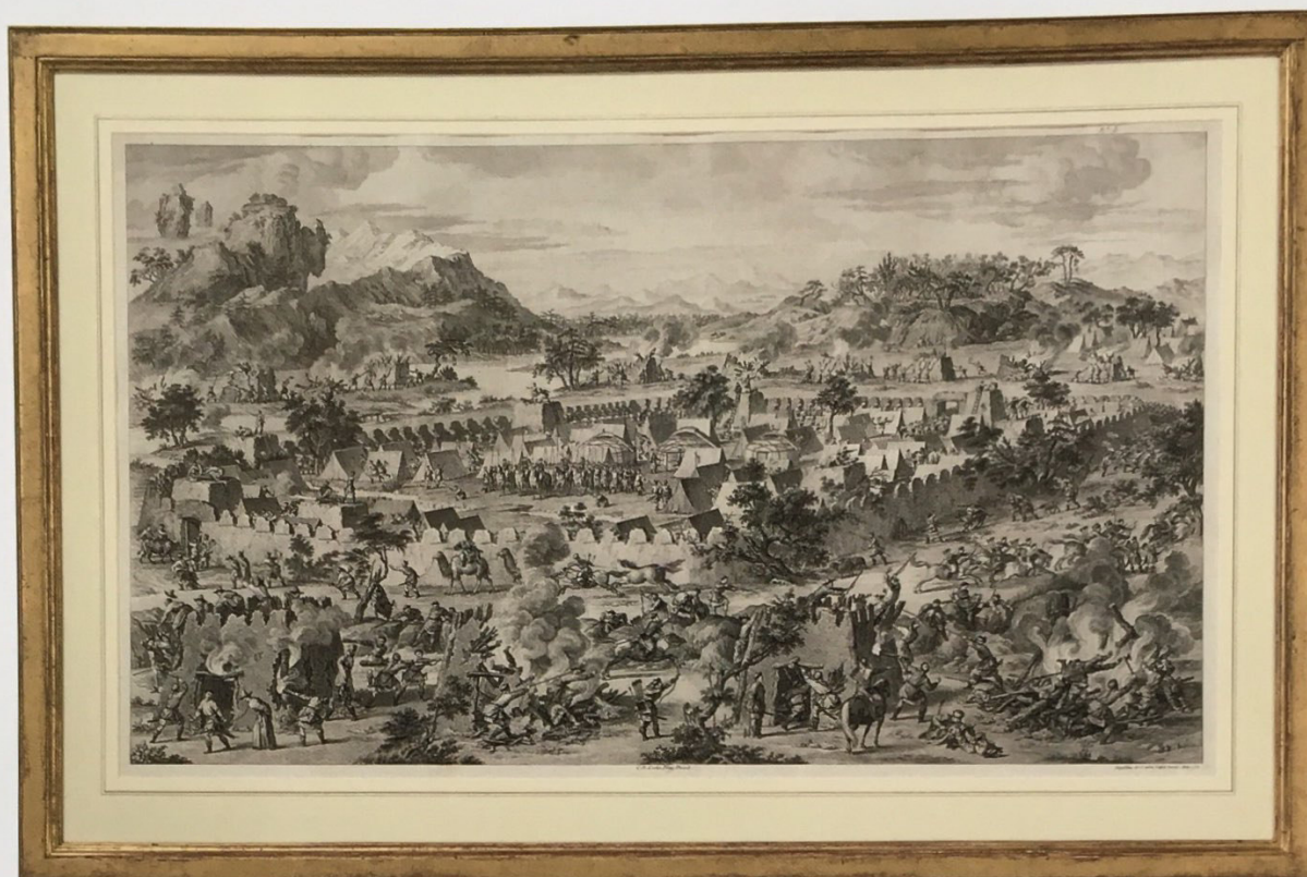
4. "The Battle of Tonguzluq" ("Le Combat de Tonguzluq") Possibly a famous episode which occurred in 1758 when Zhao Hui tried to take Yarkand for the first time. Drawn by Castiglione; engraved by St. Aubin, 1773