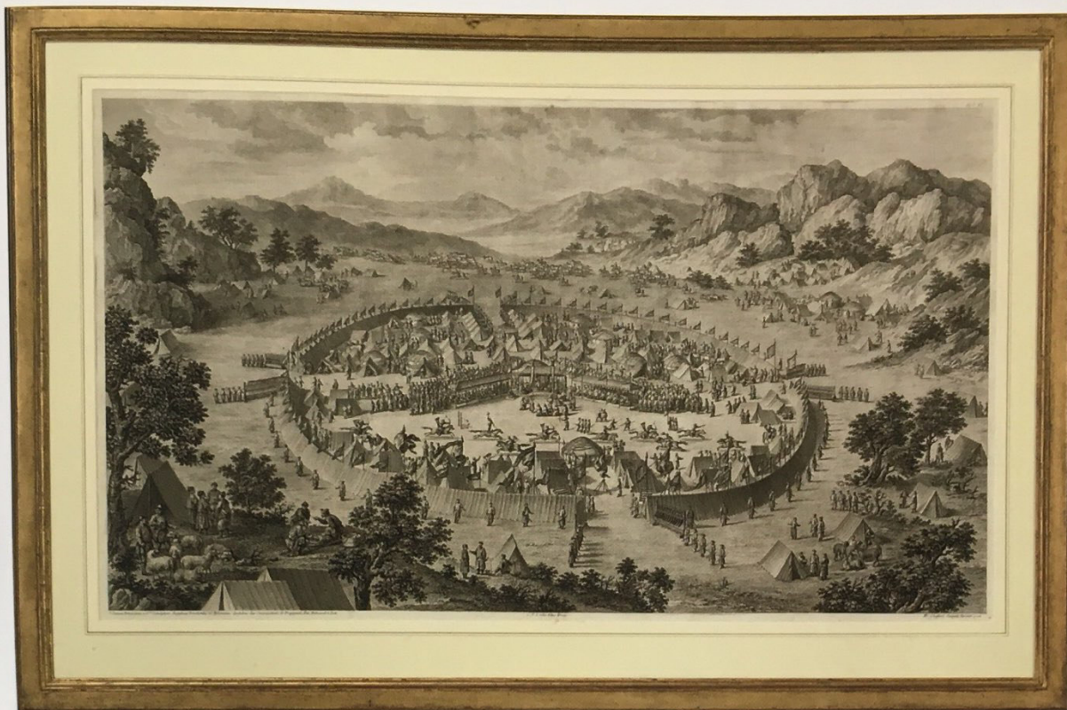
6. "The Khan of Badakhsan Asks to Surrender" ("Le Khan de Badakhsan Demande a Se Soumettre") Drawn by Damascene; engraved by Choffard, 1772