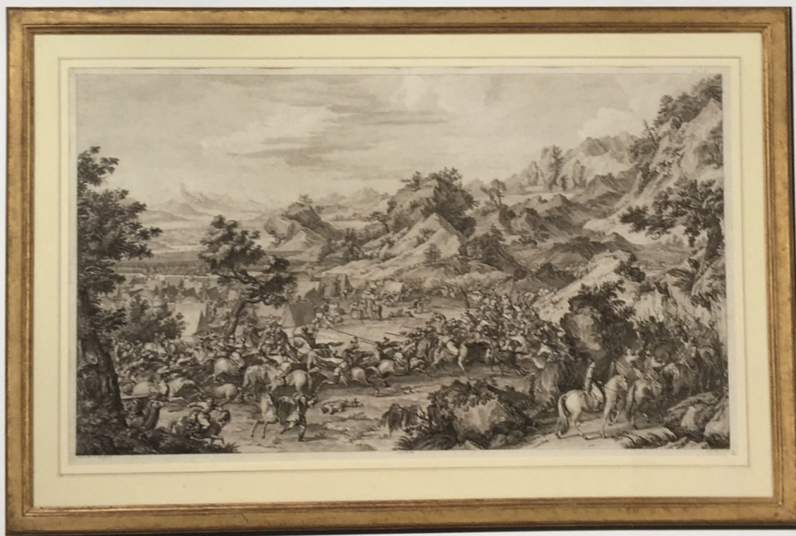
3. "Storming the Camp at Gadan-Ola" ("On the Force le Camp (établi) A Gadan-Ola") This depicts the scene where the Kalmouk Ayusi, who had defected to the Chinese side, stormed the camp on mount Gadan. Drawn by Castiglione, 1765; engraved by Le Bas, 1769