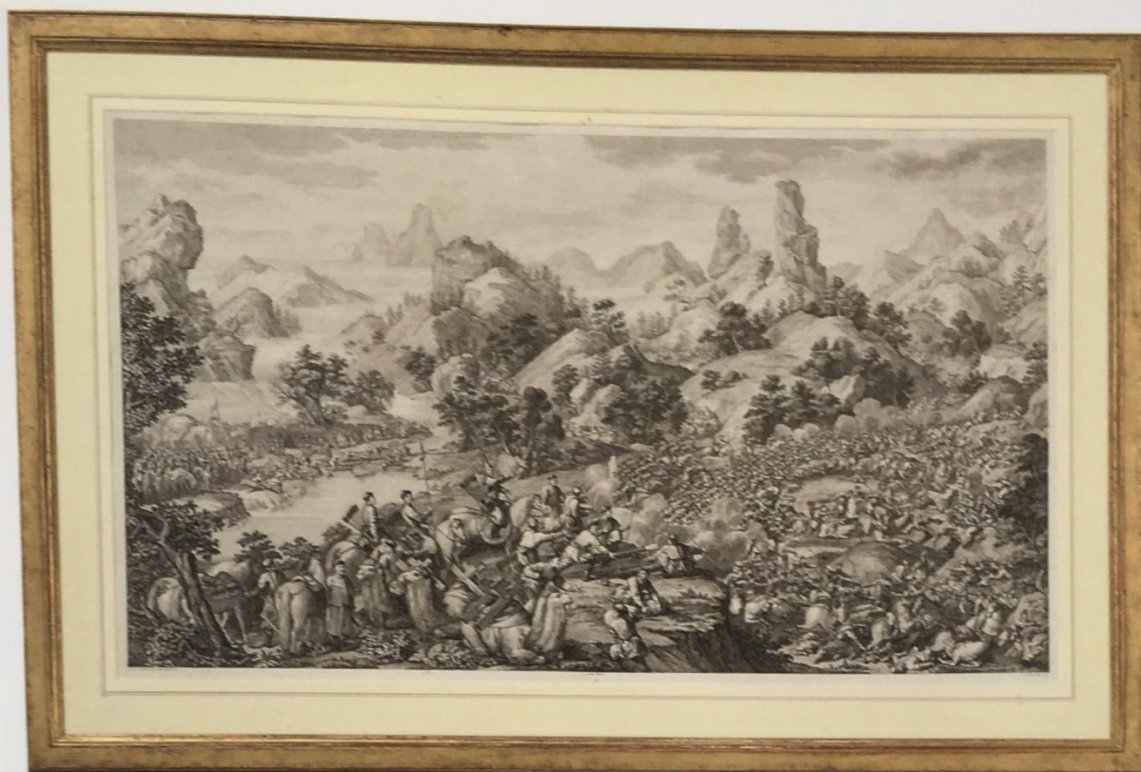
2. "The Lifting of the Siege of the Black River (Khara-Usu)" ("La Levée du Siège de la Rivière Noire [Khara-Usu]") Illustrates the final submission of the region of Kashgar. In 1758 there were still two rebel strongholds, one of Yarkand and one at Kashgar. Zhao Hui was unable to take Yarkand, moved east but was forced to retreat by the rebels, who lay siege to him at the Black River. In 1759, Zhao Hui learnt of the imminent arrival of relief troops, and so stormed the rebel town and brought the rebellion to an end Drawn by Castiglione, 1765; engraved by Le Bas, 1771