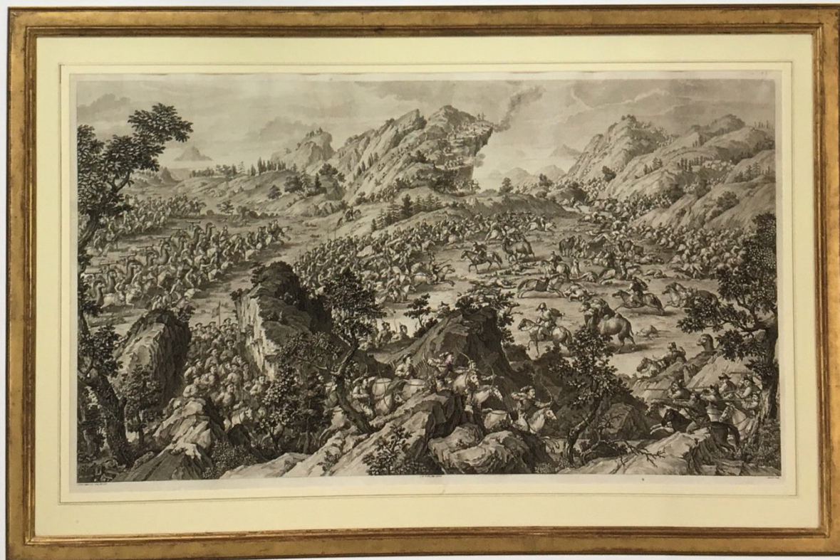
7. "The Battle of d'Arcul" ("Le Combat d'Arcul") The Khoja took refuge at Arcul after their defeat at Qos-Kucuk. Drawn by Attiret, 1765; engraved by Aliamet