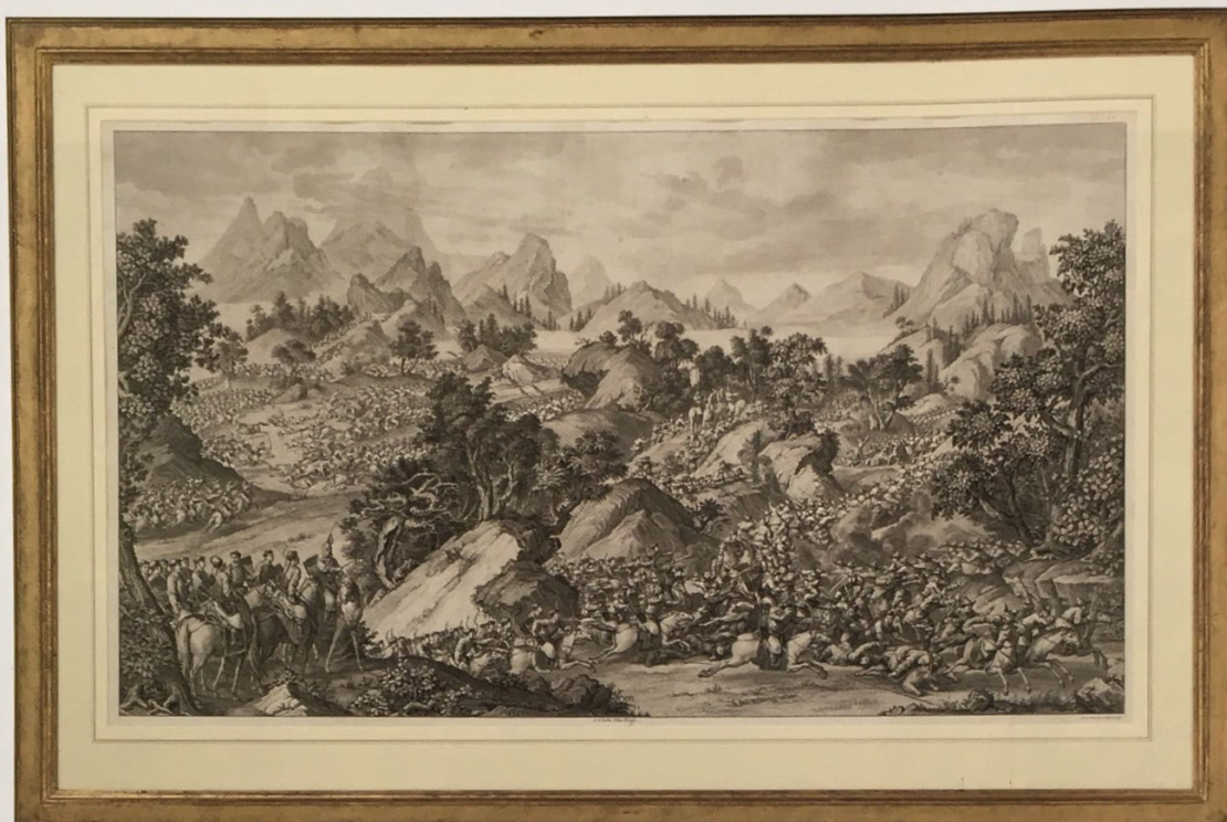
1. "The battle of Qos-Qulaq" ("Le combat de Qos-Qulaq") The Khoja were defeated here in 1759 by Ming Rui. Drawn by Castiglione; engraved by Prevot, 1774

THE PROPERTY OF A GENTLEMAN (LOTS 130-209)