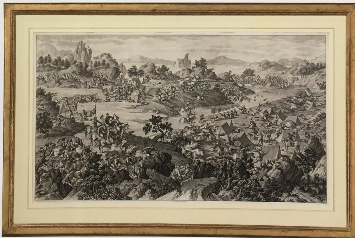
5. "The Battle of Khurungui" (Le Combat de Khurungui) The battle occurred on Mount Khurungui where Zhao Hui ambushed the partisans of Amoursana during the night Drawn by Damascene; engraved by Aliamet