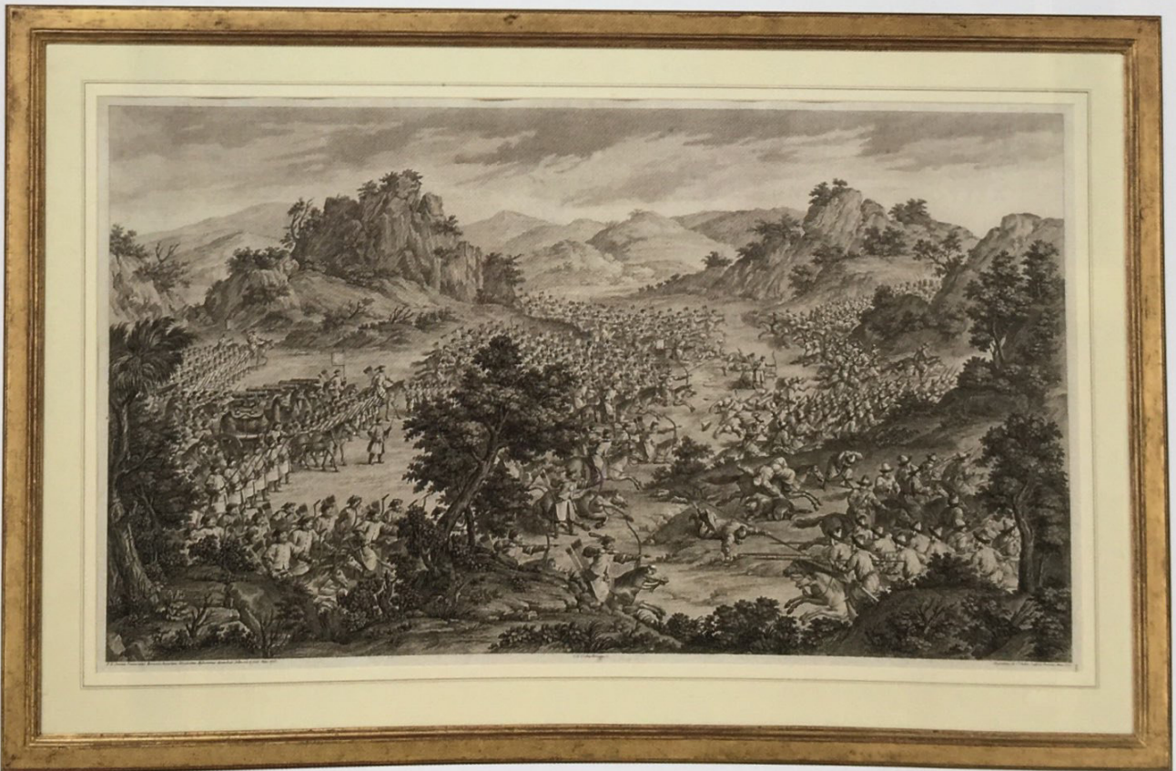
11. "The Great Victory at Qurman" ("La Grande Victoire de Qurman") In 1759 General Fu Te, with less than 600 men, battled and defeated over 5,000 Muslims. Drawn by Damascene, 1765; engraved by St. Aubin, 1770