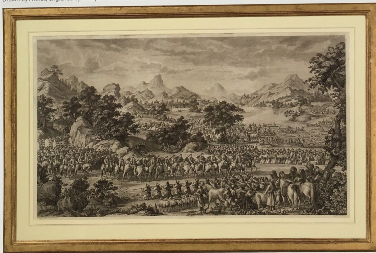
9. "The submission of the Ili" ("On reçoit la soumission de l'Ili") This refers to the first submission of the Ili in 1755. The Chinese troops marched in spring and, upon reaching Kouldja, encountered no resistance. Drawn by Sichelbarth, 1765; engraved by Prevot, 1769