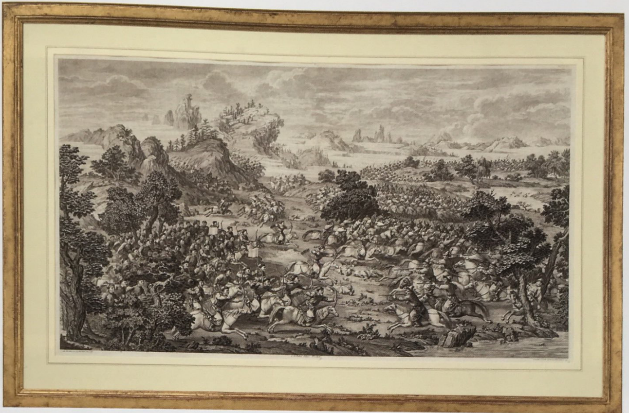
10. "The Victory of Khorgos" ("La Victoire de Khorgos") The partisans of Amoursana were defeated in 1758 by Prince Cäbdan-jab Drawn by Attiret, 1766; engraved by Le Bas, 1774