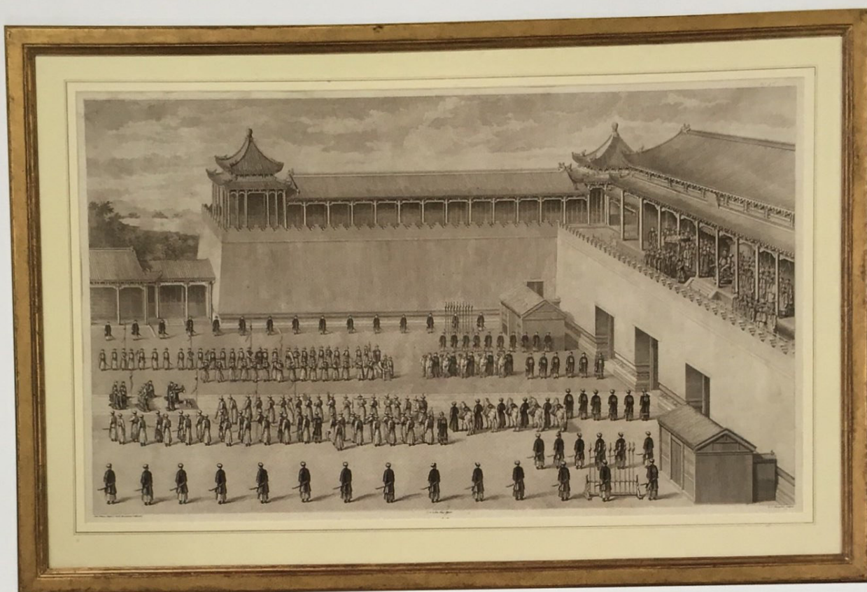
8. "The Emperor is Presented with Prisoners from the Pacification of the Muslim Tribes" ("On Offre [A L'Empereur] Les Prisonniers [Faits Lors] De La Pacification Des Tribus Musulmanes") The prisoners are presented at the palace gate of Wumen. The Emperor is also offered the head of the Khoja Huo Jizhan Drawn by Attiret; engraved by Masquelier